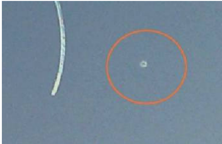
Figure 5: Houston Texas; 28 November 2012, Plane avoiding collision with UFO

It would be interesting to listen to a transcript of the pilots and controller for this incident. One has to wonder when the jet pilot became aware of the “UFO”