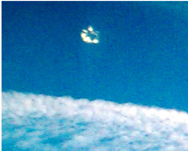
Figure 2: MUFON case # 45050; Humble Texas, 10 November 2012

Figure 2 is one possible example of this effect in action. As per the “witness”, the object was only seen when looking through the pictures. Although the sun is to the right in the complete picture, the multiple light sources in the picture eliminate the possibility this picture being the result of a simple lens flare. That however does not rule out balloons or other earthly possibilities.