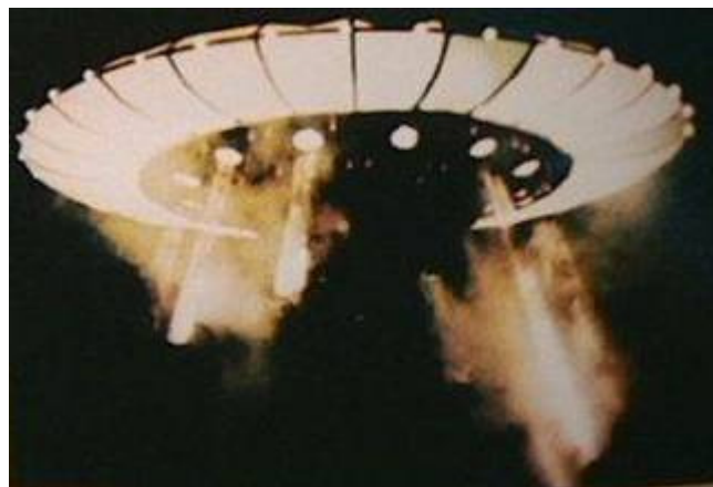
Figure 4: US Navy UFO; Photograph from Filer’s Files #45, 8 November 2012

To fit the topic of this paper, one would expect the craft in the photographs to resemble normal military craft and these do not. However, there was a recent picture in the “Special Reports” section of Filer’s Files of a “new” type of aircraft. It was stated in that article that the photo was given to Major Filer (US Air Force retired) by Commander Graham Bethune (US Navy retired). Figure 4 is a copy of that picture.